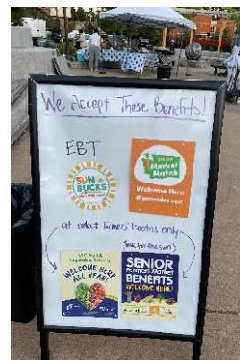
Tukwila Village Farmers Market

This report provides primary data on farmers markets in King County, Washington, quantifying their important roles in local food economies, community life, and as a key partner in food access programs. Data is collected by the Washington State Farmers Market Association (WSFMA) through an annual membership application and secondary online survey for farmers markets that are not currently members. The data source is the Washington State Farmers Market Association unless otherwise noted. Reported data is presented for King County as a whole and disaggregated for farmers markets in the City of Seattle and those that are in King County but outside of Seattle