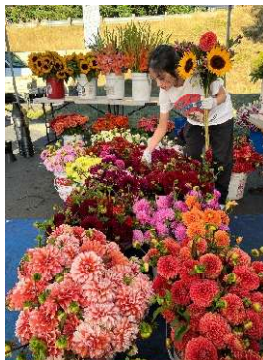
Shoreline Farmers Market