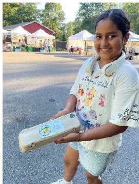
Carnation Farmers Market