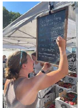
Queen Anne Farmers Market