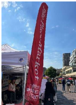
Produce on Pike