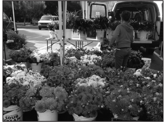
Figure 5. Flowers at farmers' market.

Interestingly, a common discourse about health and well-being centered around socioeconomic and language concerns. It was stated that most Hmong farmers cannot afford to purchase land for farming, so they must lease plots, often marginal to poor in quality and prone to flooding during high precipitation months in winter