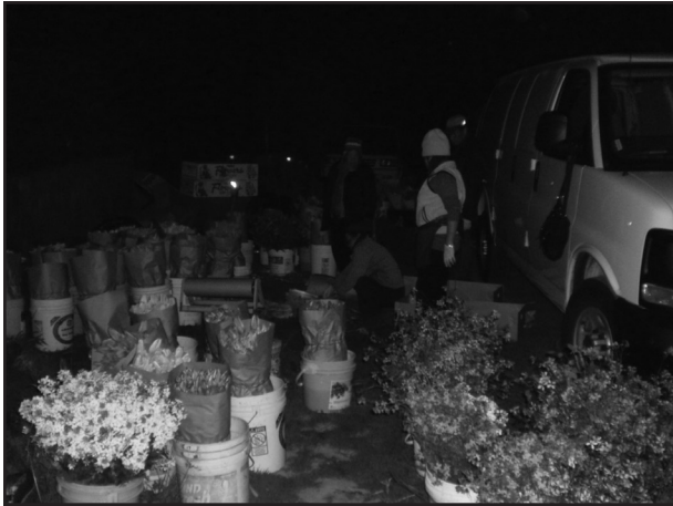
Figure 2. Preparing buckets of flowers night before taking to farmers' market.

sion before photographing individuals and avoiding photographing faces, incriminating circumstances, minors, or identified addresses or automobile license plates) (Wang & Redwood-Jones, 2001). Participants were informed that collected photographs would be shared and discussed in a group setting during the end of the growing season workshop. A research team member scheduled visits with participants periodically throughout the growing season to retrieve digital photographs that had been taken.