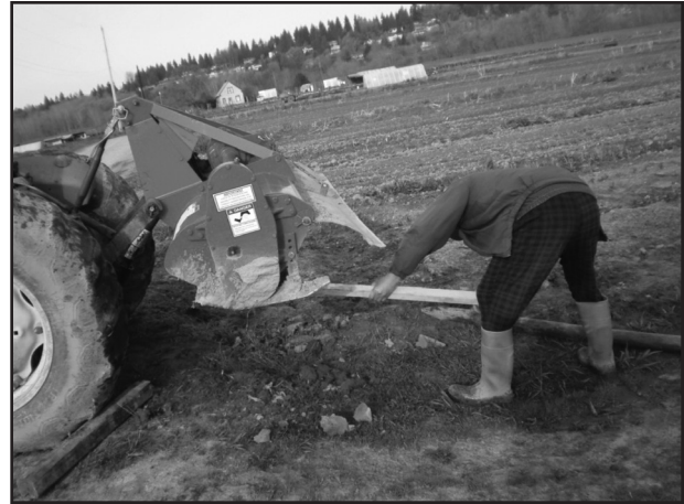
Figure 3. Farmer removing mud from tractor tiller attachment.

Participants often talked about farm work tasks that put them at risk for musculoskeletal problems. They identified tasks that generally required difficult, awkward postures and positioning, such as bending for long