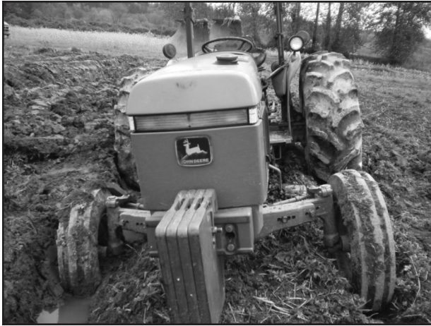
Figure 4. Tractor lodged in mud.