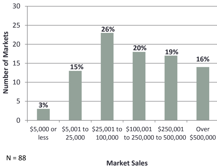
Figure 2. Farmers Market Sales