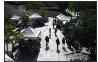
Pike Place Express City Hall Market

Farmers markets are one of the most visible cornerstones of modern farm-direct marketing. Washington State has a rich variety of farmers markets, from the world-famous Pike Place Market founded in 1907 to new markets opening each year. As with national trends, the number of markets in Washington has grown significantly, quintupling in the last two decades to just over 160. In 2010, a “Survey of Market Managers” was sent to every farmers market in the state as part of a farmers market research project 1 . With an adjusted response rate of over 78%, the responding farmers markets represented 32 out of Washington’s 39 counties.