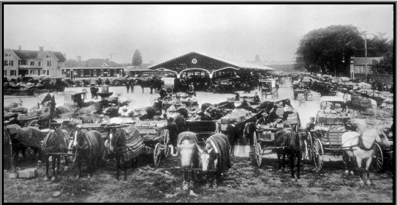
Rochester Market 1905